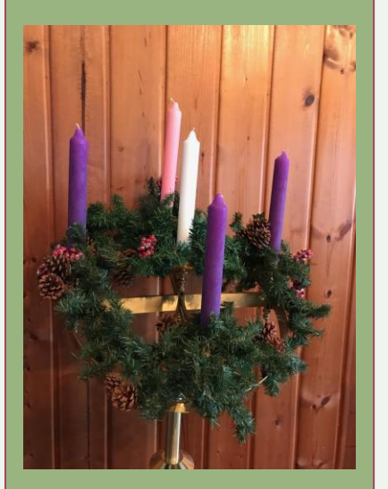
2017 Advent Wreath